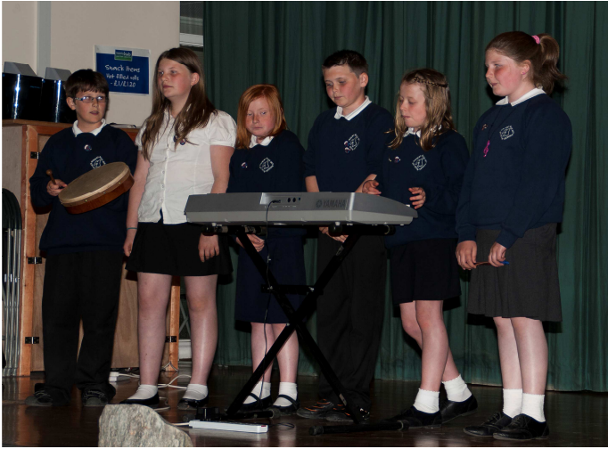
Above: Na h-Uiseagan - Bowmore Primary - winners of Folk Groups Above Right: Port Ellen Primary Gaelic Choir - winners of Psalm and Unison (Primary) Right: Coisir Òg Ghàidhlig Ìle - winners of Puirt a Beul and Choral Singing under 19 years

Chaidh Mòd Ionadail Ìle a chumail air an 2mh den t-Ògmhios ann an Àrd Sgoil Ìle. Ghabh 150 neach ionadail pàirt ann an 47 farpais thairis air an latha. 'B e seo a' chiad uair a ghabh gach Bun Sgoil air an eilean pàirt airson faisg air 20 bliadhna.