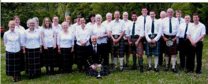
Còisir Ghàidhlig Mealabhaich

Tha e coltach gur ann am Blàran Odhar a thèid Mòd Ionadail 2014 a chumail.